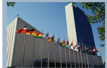
United Nations building, New York

Draft Plan for the Decade of Action for Road Safety 2011-2020 (pdf)