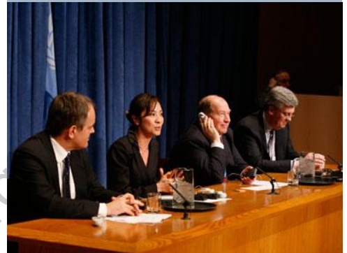
Press conference following the UN General Assembly vote