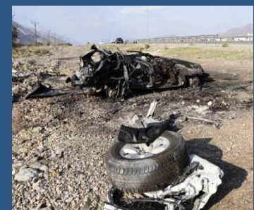
Burnt-out wreckage of 4WD in which a family of 3 died on February 21.

8 road deaths in 24 hours cause consternation and debate in the media on measures to combat speeding drivers Read more