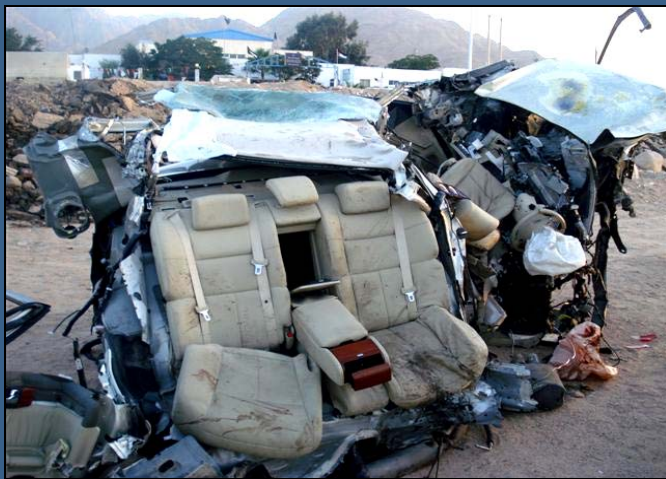
Five die in high-speed head-on collision April, 2009

Salim and Salimah, Safe and Sound السلامة مع سالم و سالمة